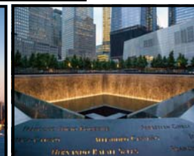
9/11 Memorial and Museum