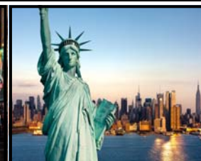
View the Statue of Liberty from the harbor