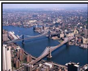
Cruise the Hudson & East Rivers